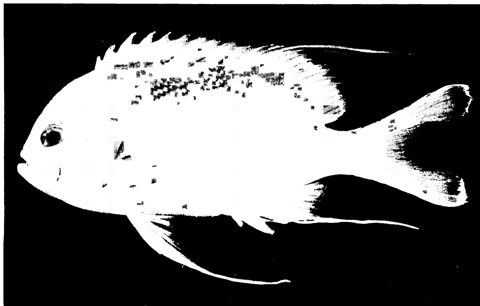
Fig. 1. Holotype of Holanthias katayamai Randall, Maugé and Plessis, 163 mm SL, Guam, BPBM 8527. (Copy of Ektachrome slide).

Holanthias chrysostictus (non Günther); Kamohara, 1934: 458, fig. 1 (Ōshima, Kochi Prefecture, Japan); Katayama, 1960: 138, pl. 73 (after Kamohara); Tomiyama, 1966: 188, fig. 1 (Hachijo Island, Japan); Kamohara and Yamakawa, 1968: 3 (Koniya, Amami-ōshima, Ryukyu Islands). Scalantarus chrysostictus (non Günther); Kata-