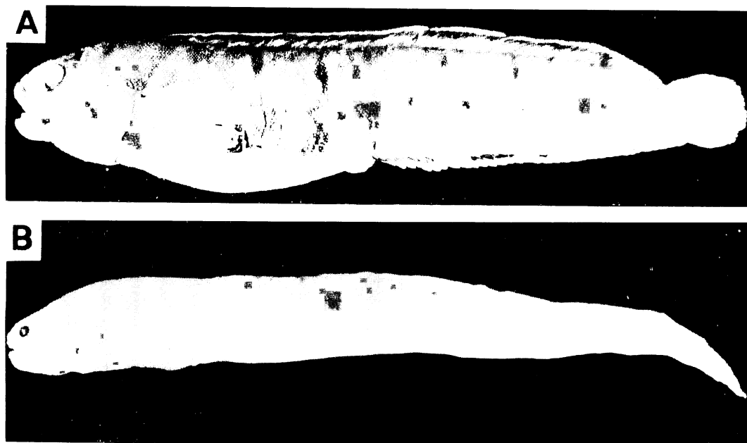
Fig. 1. Ascoldia variegata knipowitschi (A) from off Kushiro, HUMZ 41301 (404 mm SL, male) and Puzanovia rubra (B) from off Cape Erimo, HUMZ 57484 (282.7 mm TL, female).

toothless. Gill rakers 5~7+12~13, thin, short and pointed. Branchiostegals 4, the membrane broadly united, forming a fold acrossing isthmus and entirely free from it. Pseudobranchia present. Body densely covered with small cycloid scales, interorbital space and cheek also scaled. Lateral line absent. Cephalic sensory canal well developed; nasal pores 2, interorbital pores 5, postorbital pores 7, infraorbital pores 5, mandibular pores 4, preopercular pores 6, occipital pores 3 (Fig. 2, A, B).