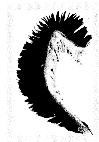
Fig. 2. Outer view of right gill arch of Xenobrama microlepis sp. nov., NSMT-P 44298.

slit and abruptly descends above tip of pelvic fin, then running along the midline of body to caudal fin base. Axillary scales long, extending about two-thirds the length of pelvic fin. Area between bases of pelvic fin flattened and as wide as eye diameter. Anus rounded, never slit-like. Snout rather sharp for this family. Anterior nostril rounded. Posterior nostril slit-like. Edges of preopercle and opercle smooth. Eye elliptical. Branchiostegal membrane completely covered by gill flap (opercular bones) when mouth closed. Branchiostegal rays 7. Gill rakers short, thick, and stout, never lath-like (Fig. 2). Pseudobranchiae present. Upper jaw extending to below posterior margin of pupil. Teeth on jaws small and conical in several rows anteriorly and two rows posteriorly; teeth on outer and inner rows enlarged. Several small teeth on vomer. Two or three rows of small teeth on palatine anteriorly,